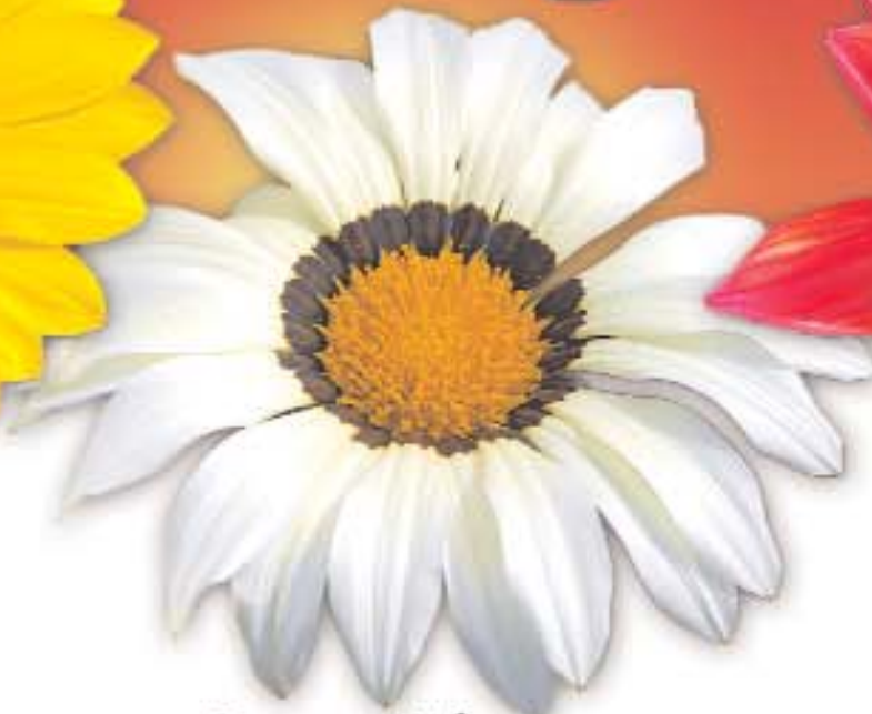
Frosty White Gazania