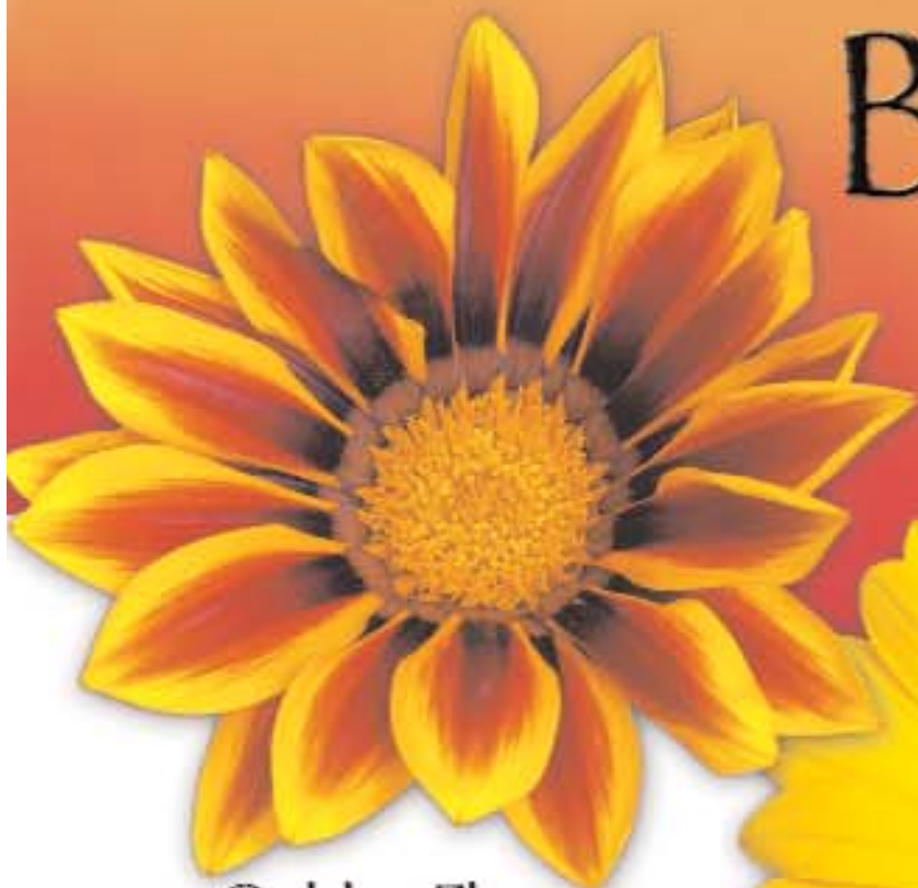
Golden Flame Gazania